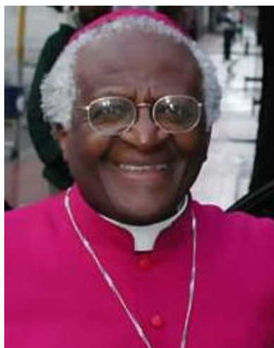
The Archbishop turns 80 on October 7, 2011

NAIM ATEEK of Sabeel Jerusalem is a featured speaker on Saturday, Nov. 5 at 9 AM. His presentation is "Palestine/Israel: The Struggle for a Just Peace". He will discuss the roots of the Palestine-Israel conflict from its theological and political perspectives, the prospects for peace in the Holy Land, how people in the U.S. are impacted, and what they can do to contribute to the achievement of peace and reconciliation. For complete program and registration information, visit the conference website: www.cta-usa.org/conference