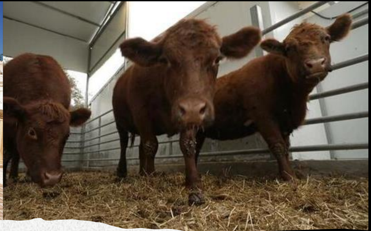
A Replica of the Temple “Red Heifers from Texas”