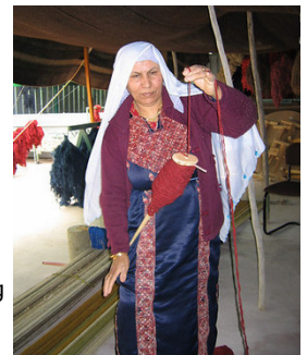
Lakiya Bedouin Weaving

Visit their website for hand-crafted gift items from Palestine: olivewood, embroidery, jewelry, clothing and more.