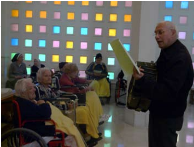
One of the weekly Sabeel Jerusalem combined Clergy-Community Programs for Lent, visiting the Notre Dame Douleurs home for the elderly in Abu Dis, a suburb of East Jerusalem.