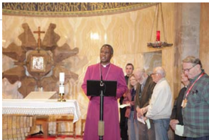
The Anglican Archbishop Thabo Makgoba of Cape Town, South Africa, preaching at the Church of All Nations in the Garden of Gethsemane.

Bethlehem was the perfect place to hold the conference. The local Palestinian Christians were pleased to host us and attended many presentations and workshops. They obviously felt uplifted by the speakers and supported by so many internationals coming to their town. Here we were, sitting in the midst of a military occupation that has lasted since 1967, with eighty-five percent of Bethlehem confiscated by Israel for the wall, settlements, by-pass roads and military installations. The people of the Bethlehem area represent