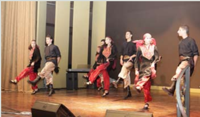
Evangelical Lutheran School's Dabkeh Group performed Dabkeh, Palestinian folklore dance, in the Cultural Event at Terra Sancta Boy's School in Bethlehem.