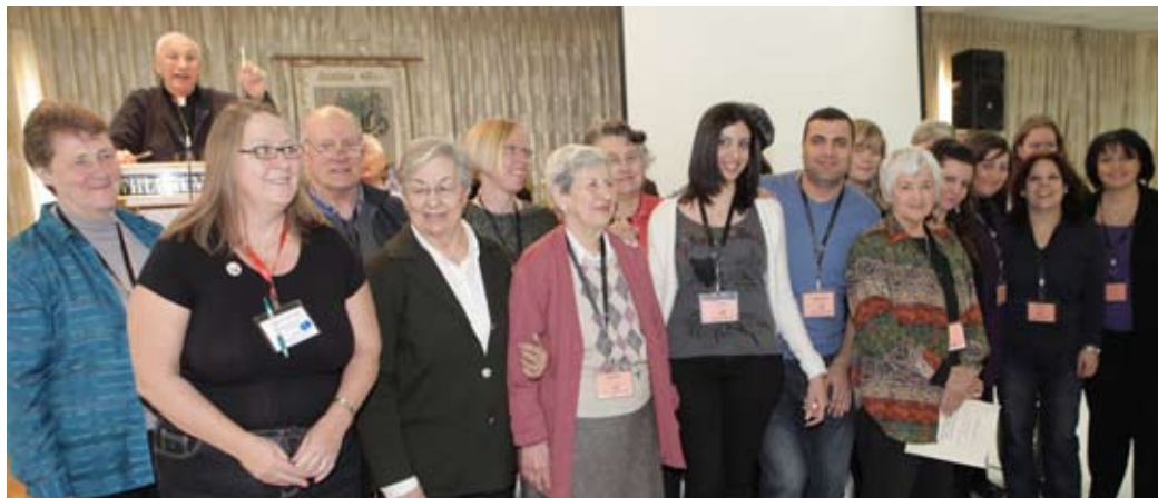
Sabeel 8 th International Conference staff and volunteers.

In light of this impasse, how can we be faithful to God and to our human values as we daily interface with Empire? Weak as we are how can we challenge and resist Empire? What does Christian radical discipleship mean for us today